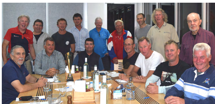
The recent PCs and deputy PCs briefing meeting.

"We're looking to give back to our volunteer members who patrol on our beach with better facilities, increased coaching across the board from nippers to masters. We'll be improving the competition gear as well."